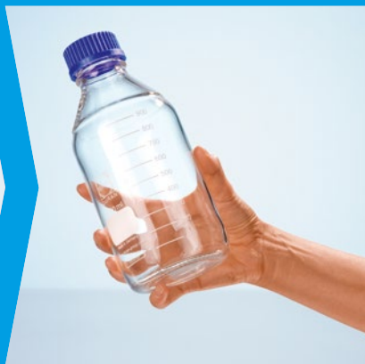
1972 – DURAN® GL 45 laboratory bottle with screw cap