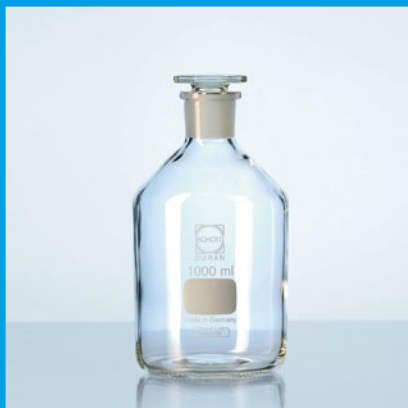
1900s – DURAN® Reagent bottle sealed with glass stopper

The result is the DURAN® YOUTILITY bottle system, a new generation of glass laboratory bottles for use in a wide and diverse range of scientific research applications. The innovation does not stop at the improved ergonomic bottle shape, but extends to dedicated accessories that incorporate many new innovative features to improve handling, sample identification, and ease of use. The new YOUTILITY bottle system helps to make laboratory work easier, safer, more economical and fun.