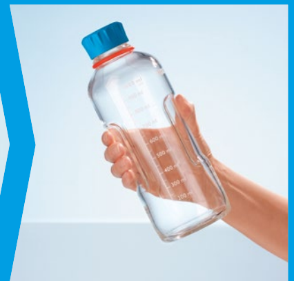
2014 – DURAN® YOUTILITY laboratory bottle system