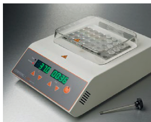
Double block digital dry bath heater