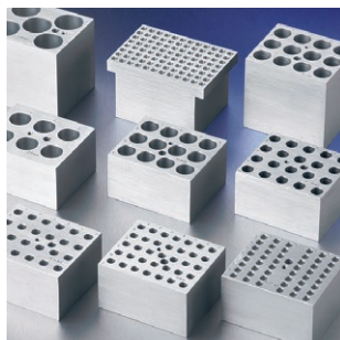
Digital dry bath heater accessories