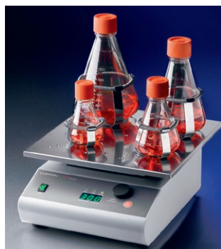
Orbital shaker with optional clamps and flasks

The Corning LSE orbital shaker meets a variety of shaking and mixing applications. A powerful brushless motor and counter-balanced shaker mechanism provides smooth operation for years of trouble-free use. Different platforms (order separately) are available and are easily interchangeable.