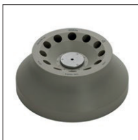
12 x 15 mL fixed angle rotor (Cat. No. 480137)