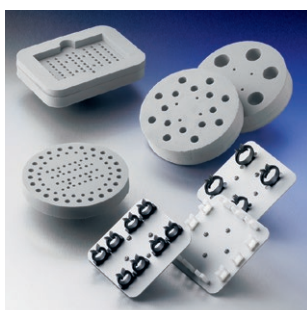
Accessory heads for Corning LSE vortex mixer