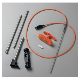
Digital hot plate accessories

When used with the digital hot plate or stirring hot plate, the external temperature controller ensures precision temperature accuracy of the liquid inside the vessel as opposed to the temperature of the hot plate top.