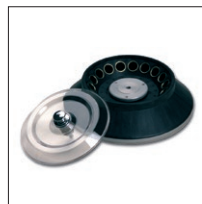
18 x 1.5 mL fixed angle rotor (Cat. No. 480139)