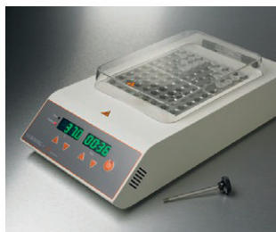
Four block digital dry bath heater