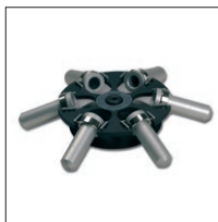
6 x 5 mL swing-out rotor (Cat. No. 480138)