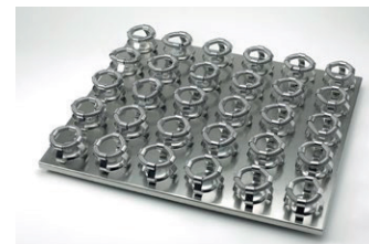
Cat. No. 480165