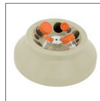
Combination rotor (Cat. No. 480143)