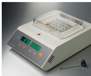
Single block digital dry bath heater