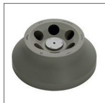
6 x 50 mL fixed angle rotor (Cat. No. 480136)