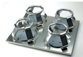
Cat. No. 480161