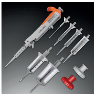
Corning Step-R Starter Pack

The Corning Step-R starter kit contains: