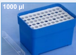
Cat. No.: 974 280