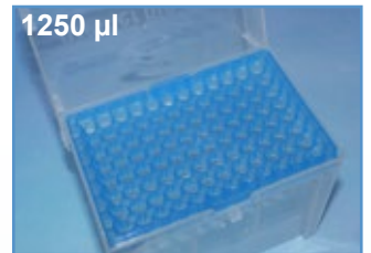
Cat. No.: 970 350