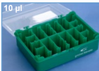
Cat. No.: 941 300