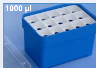
Cat. No.: 974 290