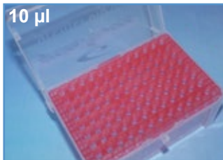
Cat. No.: 970 310