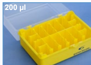
Cat. No.: 941 310