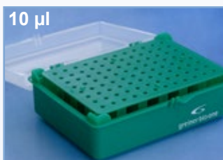
Cat. No.: 941 305