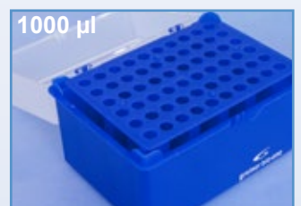
Cat. No.: 941 325