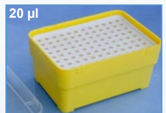
Cat. No.: 973 272