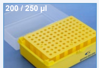
Cat. No.: 941 315