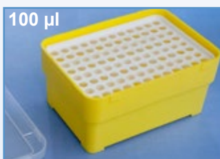
Cat. No.: 973 202