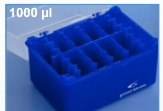
Cat. No.: 941 320