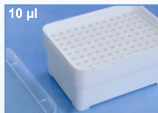
Cat. No.: 973 276