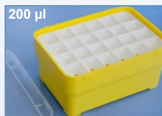
Cat. No.: 973 270