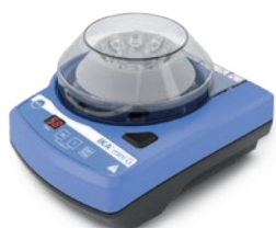
mini G Centrifuge Ident. No. 0003958000

If required, the following IKA devices are available for your lab to enhance operations using your IKA G-L centrifuge: