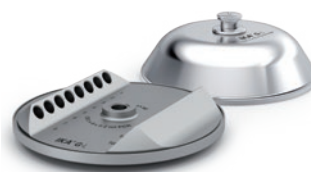
G-L PCR 0.2 mm Strip Set Accessory G-L Ident. No. 0030001334