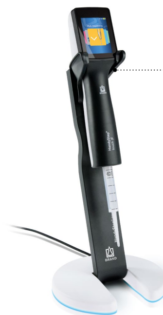
Charging stand with HandyStep® touch S and PD-Tip //