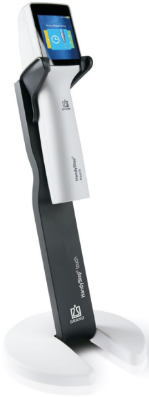
Support stand with HandyStep® touch